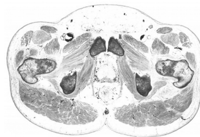
Figure 3. Transparent body slice (transverse section) produced with epoxy resins. 12