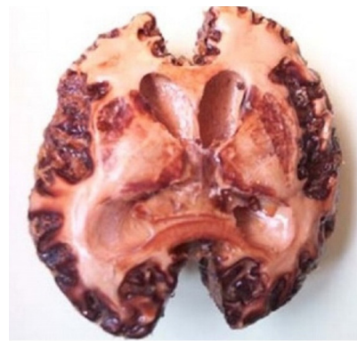
Figure 1. Brain slice produce by silicon impregnation. 19