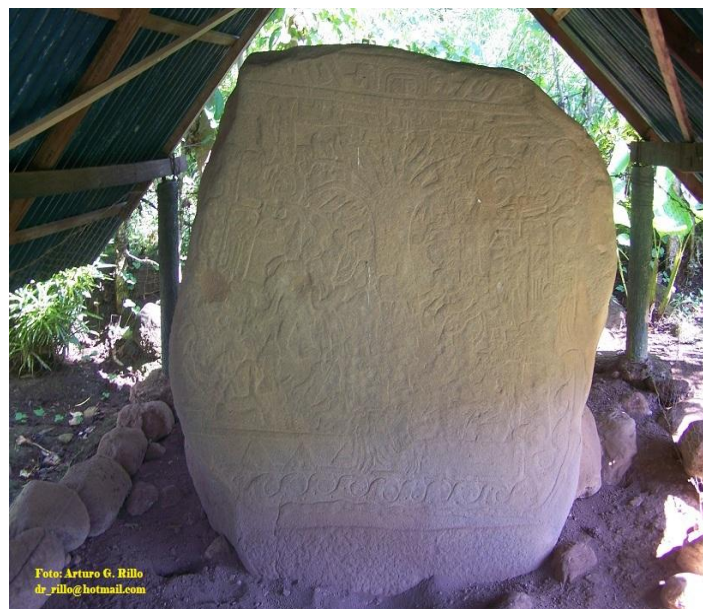
Fig. 3. Photograph of Stela 5 located at the archaeological site of Izapa, Mexico

In the left panel, six human figures are identified. Three are seated; one on the outside of the panel; the other two face to face, with an