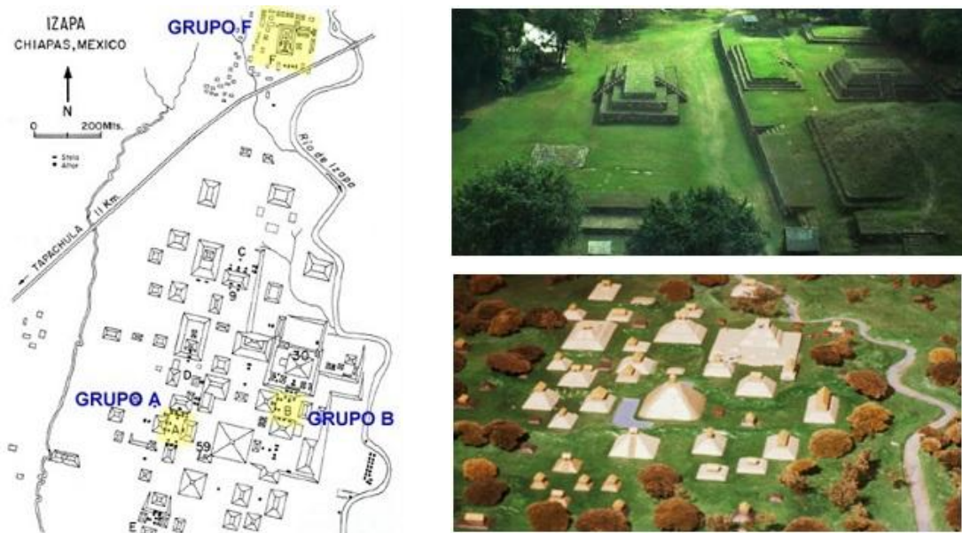
Fig. 2. On the left, the map of the main groups of the archaeological zone of Izapa, Chiapas, Mexico (taken from 16) is shown on the right: aerial photograph of Group F (taken from 17). To the right below: Reconstruction of the Izapa Central Temple (taken from 18)

figures, as well as birds and fish. Taking the tree as its center, the image can be divided into left and right; an upper panel and a lower panel.