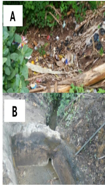
Fig. 5. Waste dump site (A) and palm oil mill waste passage (B)