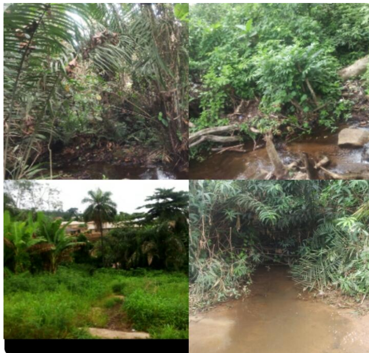
Fig. 1. Riparian zone of Ogangan River

Human activities such as agricultural, residential, industrial, with agricultural being the dominant were identified in the riparian zone of Ogangan river. Residents around the River make use of the water for drinking, cooking, bathing, laundry and some for irrigation (Fig. 2). Water from the River is used for washing farm produce such as