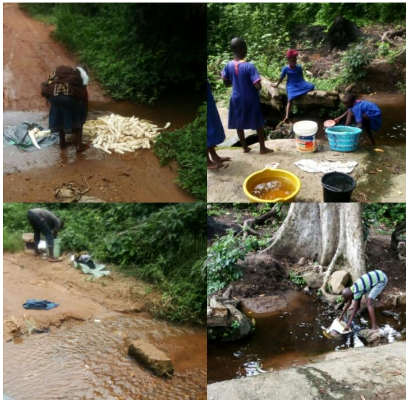
Fig. 2. Various uses of the Ogangan River

The major impact of agriculture on riparian areas has been their conversion to other plant species via such as forestry, row crop agriculture, and livestock grazing. The periodic removal of trees by forestry has the potential to alter the long-term composition and character of riparian forests. Where large portions of the standing timber are harvested or where the period between harvest operations is short, substantial changes to the composition, structure, and function of riparian forests will almost certainly result. The harvest of riparian forests can increase the amount of solar radiation reaching a stream, which can increase water temperatures and affect aquatic primary production. The removal of vegetative cover can impair the ability of riparian areas to retain water, sediment, and nutrients such as nitrogen and phosphorus. In general, the effects of human activities on riparian structure and function are much greater when forests are clear-cut or harvested right up to stream banks and lake shorelines.