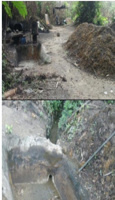
Fig. 4. Oil palm mill