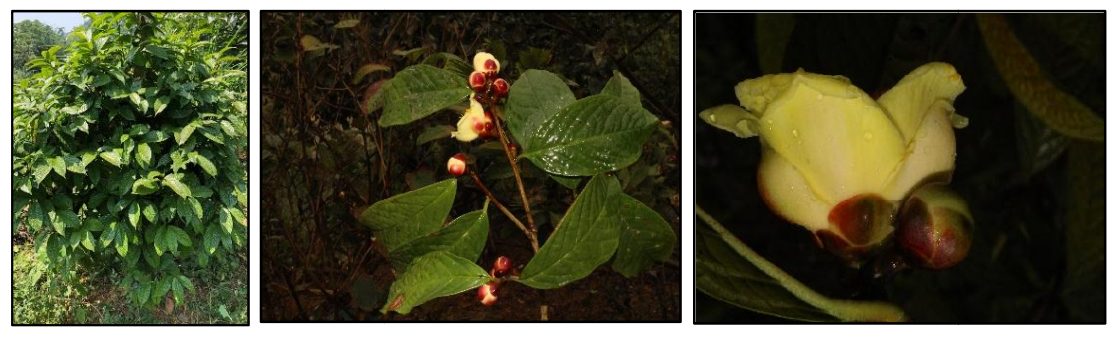
Fig. 1. Planted tree (left), flower buds (middle), and flower (right)

Camellia impressinervis naturally distributes in Southern China and Northern Vietnam [3,7-8]. Camellia impressinervis was recorded to be planted in Thach An district, Cao Bang province, Northern Vietnam [11]. It was planted personally by local people in their gardens. Therefore, this study was conducted at a plantation in Thach An district (22°24′56.8″, 106°25′23.9″). Data collection was permitted by plantation owners.