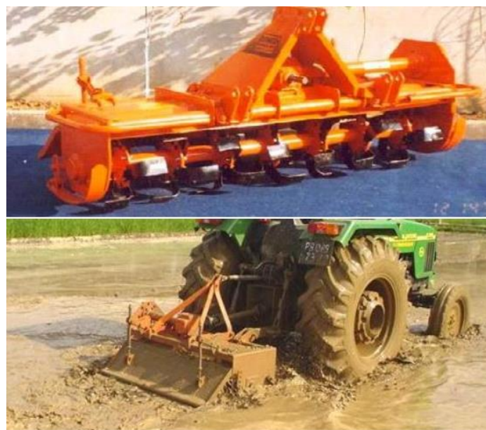
Fig. 4. Rotavator [28]