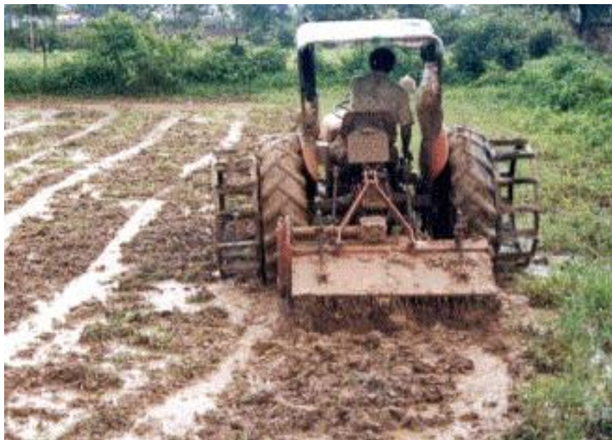
Fig. 1. Puddling on a wetland [88]

The process of puddling contributes to the formation of a compacted soil layer in rice fields, impacting water infiltration and drainage. This compaction, while reducing water permeability, enhances water retention in the root zone, a critical factor for the initial stages of rice growth, especially during germination and early seedling development. Given the adaptability of rice plants to anaerobic environments, puddling ensures the saturation of soil with water, creating conditions conducive to early growth. However, the sustainability of puddling practices has come under scrutiny due to potential long-term repercussions on essential soil properties.