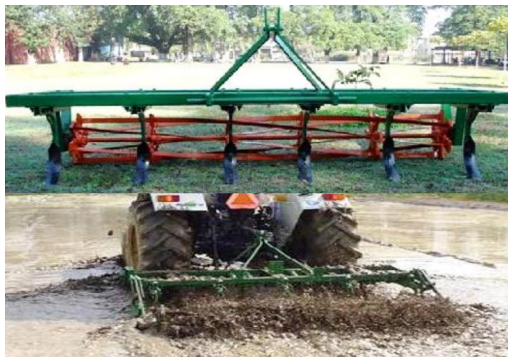
Fig. 3. Pulverizing roller [28]

accommodating both dry and wetland conditions. Its components typically include a frame, a rotary shaft equipped with blades, and a power transmission system connecting the gearbox to the shaft. The Tractor-Mounted Puddlers, similar to a rotavator but distinct in their design, tractor-mounted puddlers are equipped with less robust structures, featuring smaller drums and shoes. They tend to be wider than standard rotavators and can be operated in both wet and dry soil conditions, although they are most effective in fields with standing water. These puddlers are designed to leave the field surface level and yield optimal results when guided by laser technology [28].