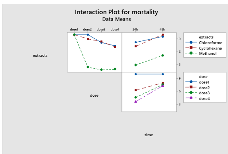
Fig. 3. Interaction between extracts and doses, extracts and time, doses and time