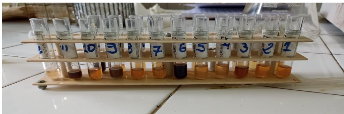
Fig. 1. Phytochemical testing equipment in the laboratory