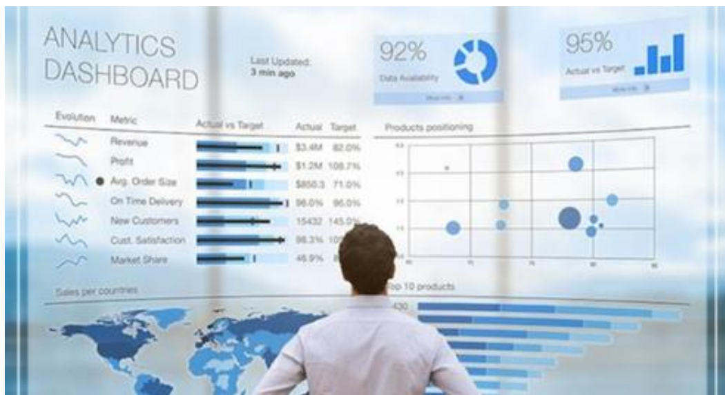
Fig. 3. Multi-Dimensional Dashboard for Blockchain Data Analytics

The first challenge for the block chain is its failure to manage the clinical data transaction rate. Blockchain records modifications to a limited volume of data (such as balance of accounts, identity of the owner, etc.). On the other hand, the costs involved with creating a massive ledger to record a large amount of data, and the difficulty involved in doing proof-of-work on this ledger, prevent storing a large amount of data on the blockchain [12]. Proposed solutions include that using a different approach to consensus than proof-of-work, verify evidence using proof-of-stake. Patient data can be held on private (permissioned) regional blockchains with throughput capacities to support high transaction volumes while being validated only occasionally.