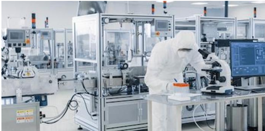
Fig.1. Health Data Analytics