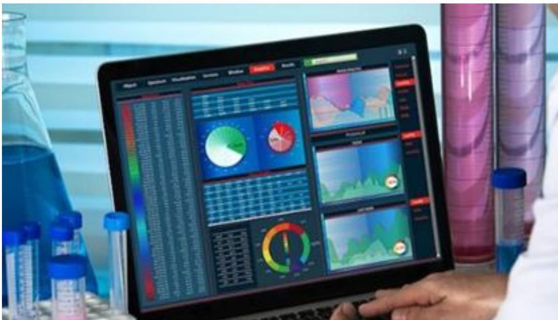
Fig. 2. Dashboard for Blockchain Data Analytics

The majority of the proposals create blockchain's power to archive patients' health history immutably, enabling them to grant and withdraw their medical records as they wish. In a standard scheme, a health association maintains and maintains the patient's health record (e.g. hospital, clinic, etc.). Information may be communicated openly between the organisation and a Regional Health Information Organization (RHIO) or any entity which has a business relationship with the institution of origin. If the organisations are not entered into a business arrangement, one-off demands can be made, however time and wait may be required [7,8].