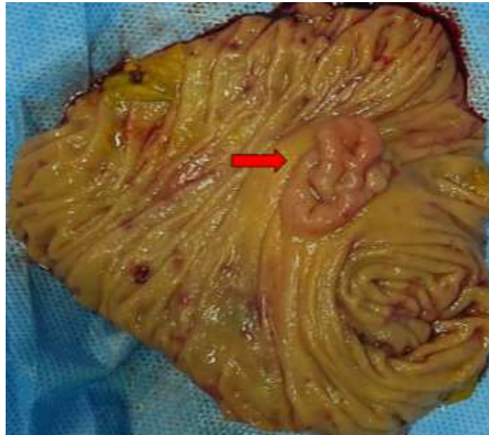
Fig. 2. Endoluminal aspect after eversion of the polyp shown by the red arrow

A complete colonoscopy did not identify any abnormalities in the colon, and neither did an abdominal CT scan. Consequently, an exploratory laparoscopy was conducted to investigate the possible presence of a small tumor that might have been missed by the CT scan. During the laparoscopy, the liver and stomach appeared healthy. A thorough examination of the small intestine was performed, involving gentle unrolling and palpation using an atraumatic fenestrated clamp. It was in the terminal portion of the last ileal loop that a firm, fixed 2.5 cm mass was discovered. As a result, an ileocecal resection was deemed necessary.