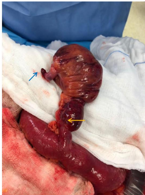
Image 3. Meckel's diverticulum with mesodiverticular band (blue arrow) and narrow base (yellow arrow)