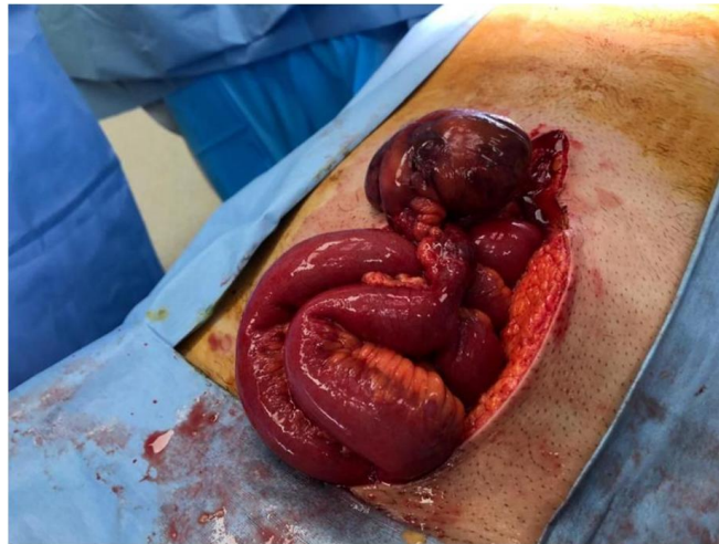
Image 2. Intraoperative finding of a strangulated Meckels diverticulum secondary to axial torsion on its base with purulent peritonitis