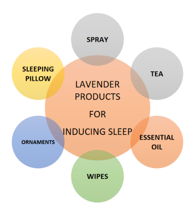
Fig. 3. Lavender products for inducing sleep Include references