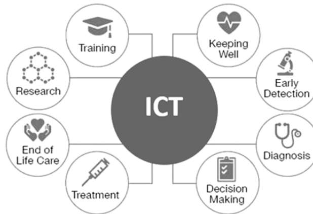
Figure 3. ICT and good health sustainability

Network technologies also offer modern measure to meet both the current and the future challenges of life. Further advances in ICT have tremendously improved our social and economic conditions across the world (Haluza & Jungwirth, 2015). ICT has rapidly improved the method of accessing and disseminating information in the health sector to all world. The provision of new tools such as modern software systems, enterprise applications, robots and artificial intelligence in the health sector also contributes to achieving sustainable goals for optimum results. Some of the core health sector areas positively affected by ICT are considered in the following sections.