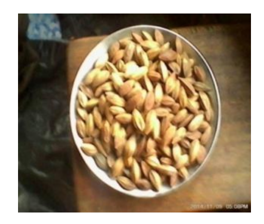
Plate 1b. Seeds of Canarium schweinfurthii