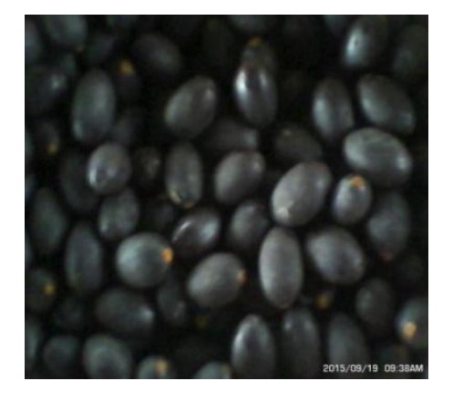
Plate 1a. Ripe fruits of Canarium schweinfurthii

and resins, medicine. The seeds are also used as a flooring material for decoration and arithmetic counters in schools. Despite the apparent economic importance of Canarium schweinfurthii in Nigeria, the existence of this species is threatened by increased deforestation, urbanization and other infrastructural developments. The growth of any tree begins with the germination of its most important propagule, the seed [7]. Lots of seeds are lost annually due to low germination status after free fruit fall from the mother tree; the seed coat dormancy being partly responsible, thereby threatening the existence of the species. The fruit being used as food also reduces what should have been available in the forest seed store for natural regeneration. There is need to test different pre-sowing treatments that would break the seed dormancy and ensure quick and uniform germination of this species. The aim of this investigation was to assess the effect of seed source and different pre-sowing treatments on germination of Canarium schweinfurthii seeds.