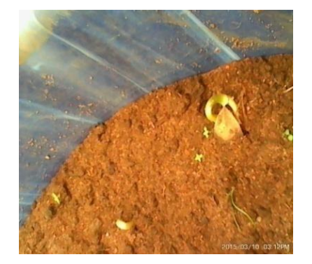
Plate 2a. The new seedlings emerged with the hypocotyle forming a hook like structure through the soil surface

The germination period (GP), which is the period from the first day of germination to the last day of germination ranged between 5 and 92 days for both seed sources. For treatments BG, 7H, SW and CT, it ranged between 20-50 days after germination (DAG). Generally, irrespective of the source, the germination period of CR and PC treatments was between 5-16 days; but those of CT took 49 and 92 days for sources T_2 and T_1 respectively (Table 1). For it took T<sub>1</sub>6, 11, 40, 22, 52, 92 days to complete their germination in CR, PC, BG, 7H, SW and CT respectively. Also for T<sub>2</sub>, it took 5, 16, 36, 15, 44, and 49 days for CR, PC, BG, 7H, SW and CT respectively to complete their germination. There was a great disparity (43 days) between the germination periods for treatment CT in T_1 and T_2 . The T_2 source had mean germination period of 23.6 days while that of T<sub>1</sub> was 31.7 days. Germination periods for the two sources were significantly different (Table 2).