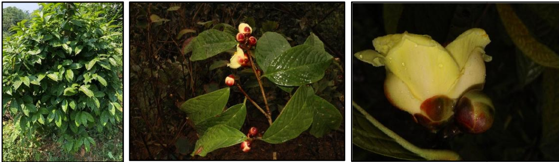
Fig. 1. Planted tree (left), flower buds (middle), and flower (right)

Camellia impressinervis naturally distributes in Southern China and Northern Vietnam [3,7-8]. Camellia impressinervis was recorded to be planted in Thach An district, Cao Bang province, Northern Vietnam [11]. It was planted personally by local people in their gardens. Therefore, this study was conducted at a plantation in Thach An district ( 22^\circ 24' 56.8'' , 106^\circ 25' 23.9'' ). Data collection was permitted by plantation owners.