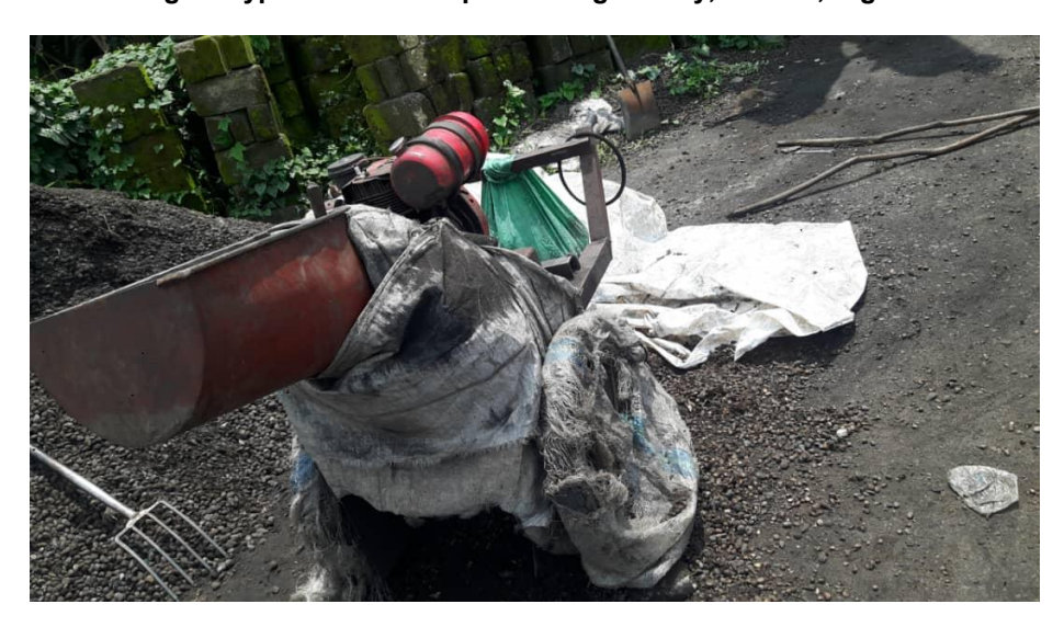
Fig. 3. Typical mechanical kernel cracking machine

saline solution. This technology increase the moisture content of the kernel requiring increase in labour, drudgery and cost to dry. Others use mechanical separation machineries which increases the cost of investment, high power and energy requirement, large space demand. The relationship between manual cracking and manual separation of palm kernel, mechanical cracking and mechanical cracking and pneumatic separation of palm kernel was studied.