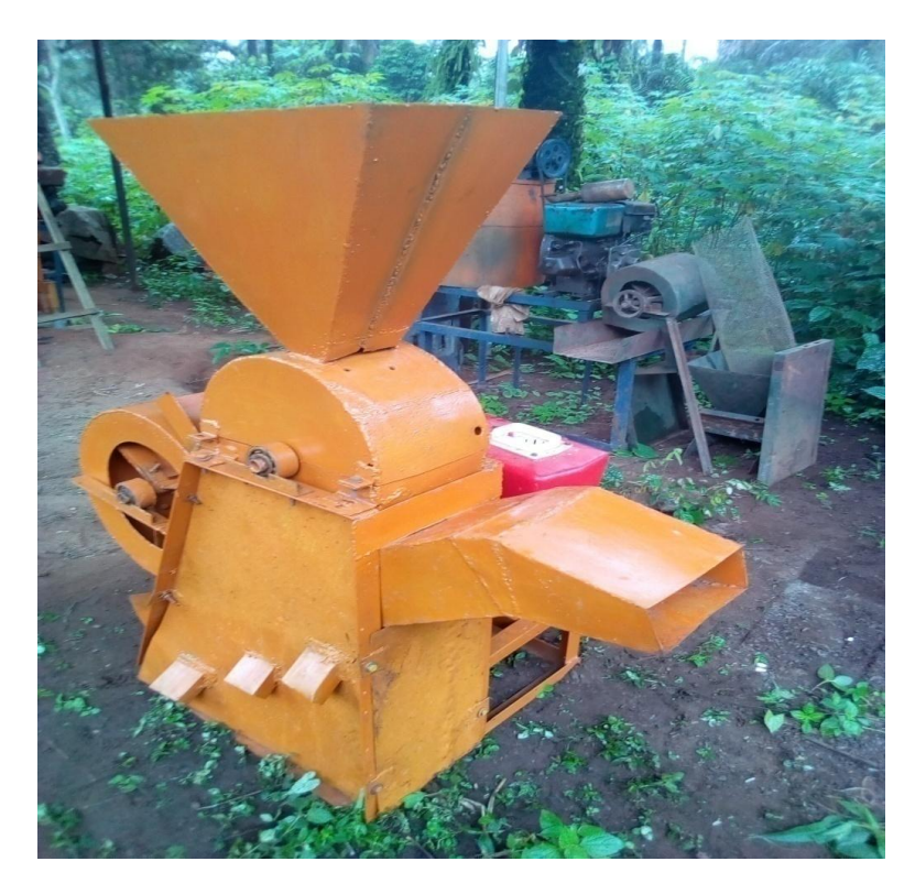
Fig. 4. Deofingers manufactured palm kernel cracking and Pneumatics separating machine

This simple machinery is made up of the Hopper, cracking chamber, Rotor Assembly with hammers discharge battle, Blower Assembly, support frame of Angle Iron, Prime mover and sitting pulleys, bearings and belts (see Fig. 4).