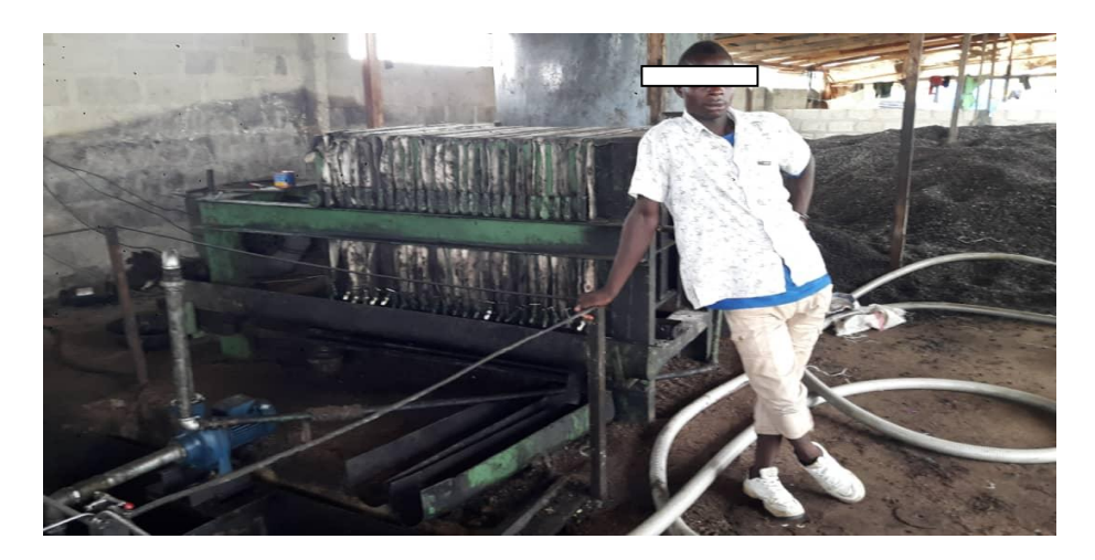
Fig. 2. Typical Kernel oil processing factory, Mbaise, Nigeria