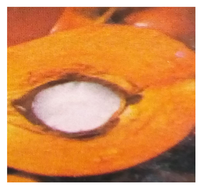
Fig. 1. A palm fruit showing the pulp, shell and kernel nut

Some local entrepreneur uses hydro system to separate kernel from shell either with red mud or