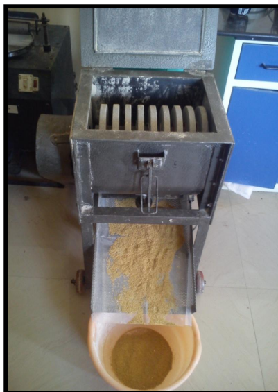
Plate 1. Abrasive dehuller

The grains were dehulled in an abrasive dehuller (Gurunanak Engineering Co, Hyderabad) up to 17 percent removal of bran. Roller abrasive dehulling machine was used for dehulling the grains by adjusting the time. The dehulled grains were collected through bottom opening of the dehuller along with hull. The bran was separated from the dehulled grain through the sieve attached to the dehuller. The separated grain was further winnowed to ensure grain without any adhering bran (Plate 1).