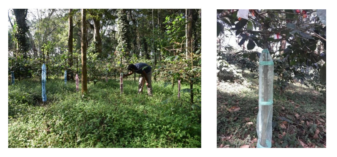
Plate 1. Caging of borer-infested plants in fields for monitoring adult emergence

Observations on the number of beetles emerged in each caged plant at each location at weekly intervals for two years